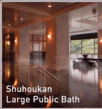
Shuhoukan Large Public Bath