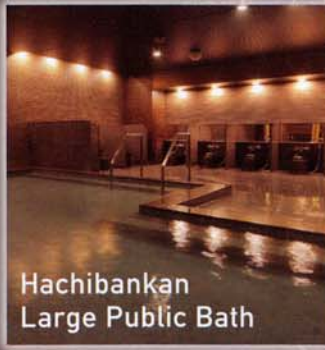
Hachibankan Large Public Bath