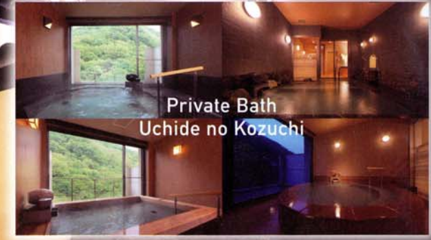
Private Bath Uchide no Kozuchi