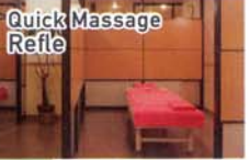
Quick Massage Refle