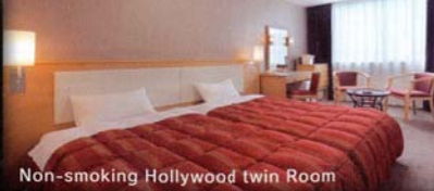
Non-smoking Hollywood twin Room

A compact Western-style room with a calm atmosphere. Two Hollywood-type beds snuggled together.