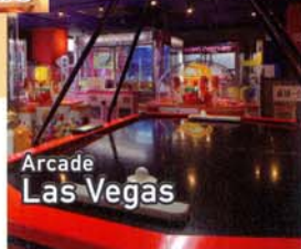
Arcade Las Vegas